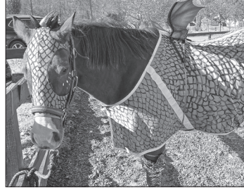
RIGHT: Santana the magic dragon.